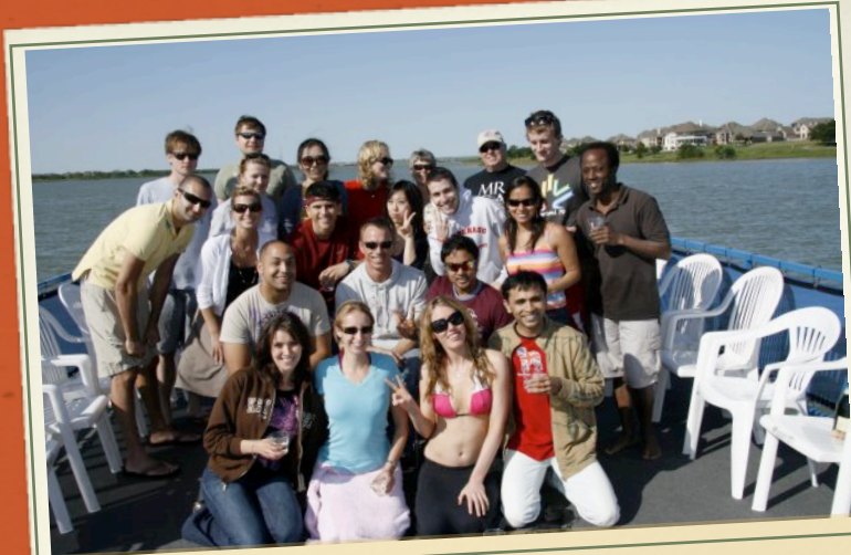
GRADUATION PARTY SPRING 2009 LAKE LEWISVILLE, TX